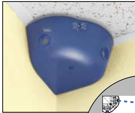
SW99-2029—fits snugly into concave corners with views down two corridors

True Blue Beacon — You'll deter would-be perpetrators while reassuring employees and guests. The "true blue" LED, says Spyder is recording for you.